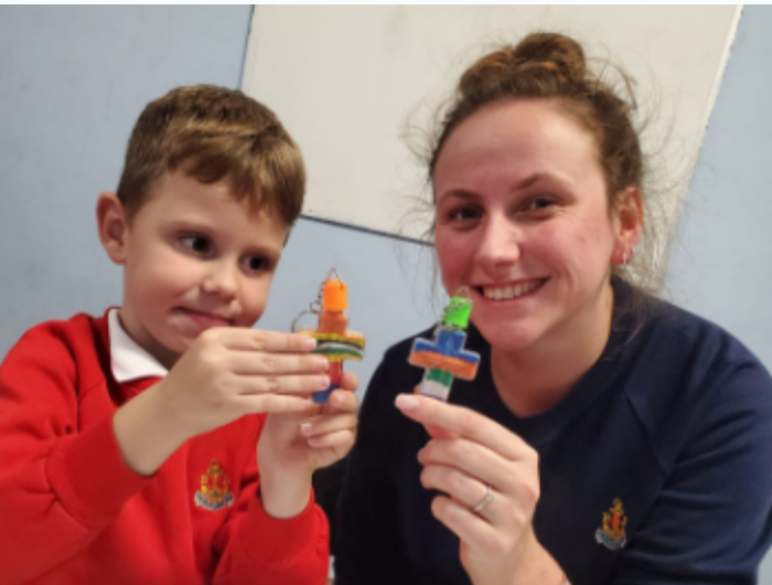
Finished, sand-filled Crosses.

The message of the cross is foolish to those who are headed for destruction! But we who are being saved know it is the very power of God.